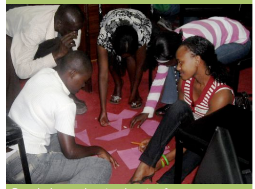
Social work students from Nairobi Aviation College

We serve marginalized and disadvantaged communities in Kenya and Eastern Africa, including women, the youth, rural communities, refugees, asylum seeker and prisoners.