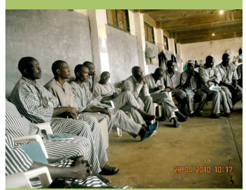
Prisoners in Shimo Latewa Maximum prison, Mombasa