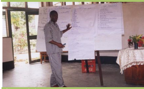
A participant presenting an exercise during a workshop