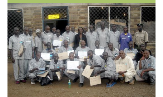
A group of participants with their workshop certificates